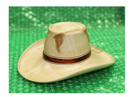
2 Small Hat