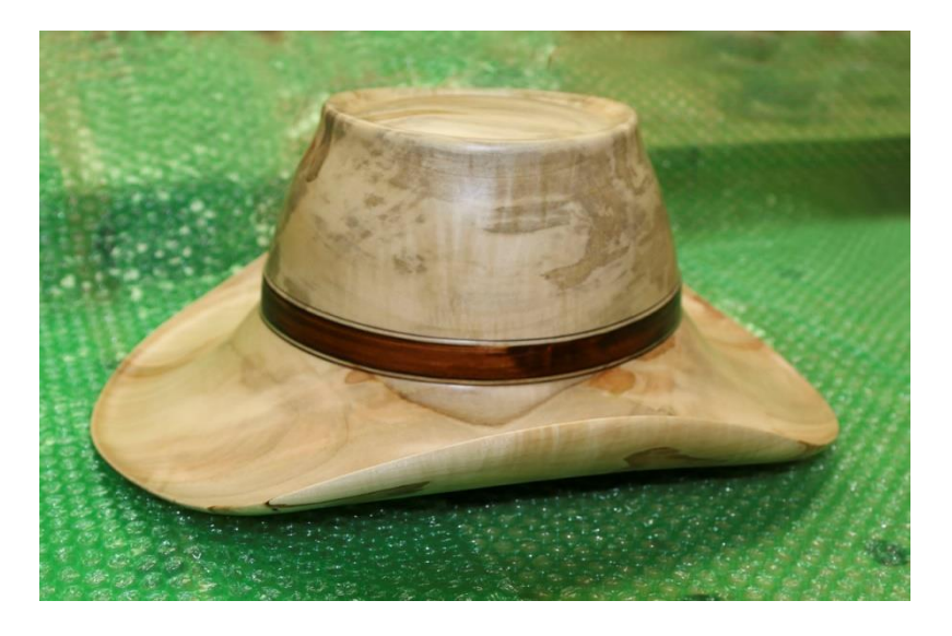
1 Large Hat