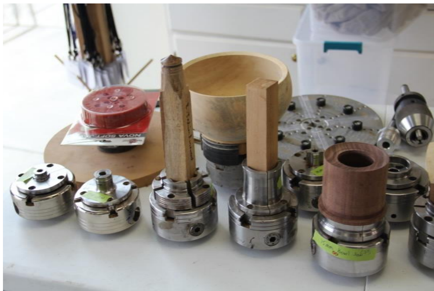
JUST SOME OF THE CHUCKS THAT WERE COVERED IN OUR JULY DEMO!