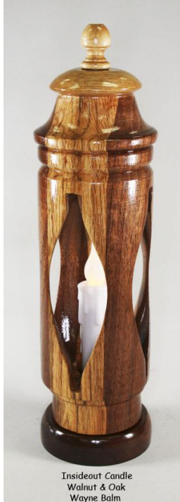
Insideout Candle Walnut & Oak Wayne Balm