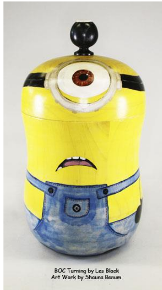
BOC Turning by Les Black Art Work by Shauna Berum