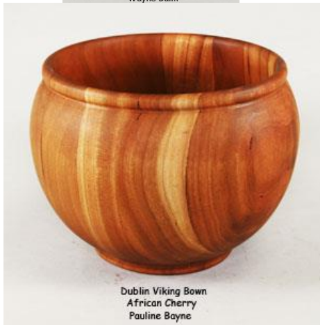
Dublin Viking Bown African Cherry Pauline Boyne