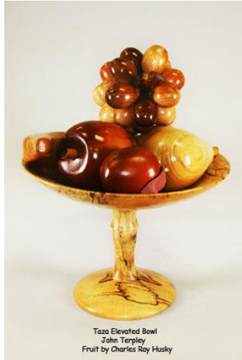
Taza Elevated Bowl John Terpley Fruit by Charles Ray Husky