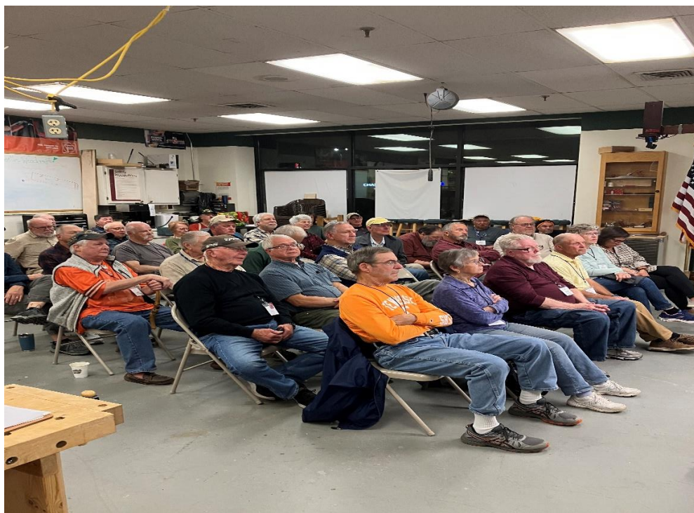
OCT. 2024 MEETING @ KNOXVILLE WOODCRAFT