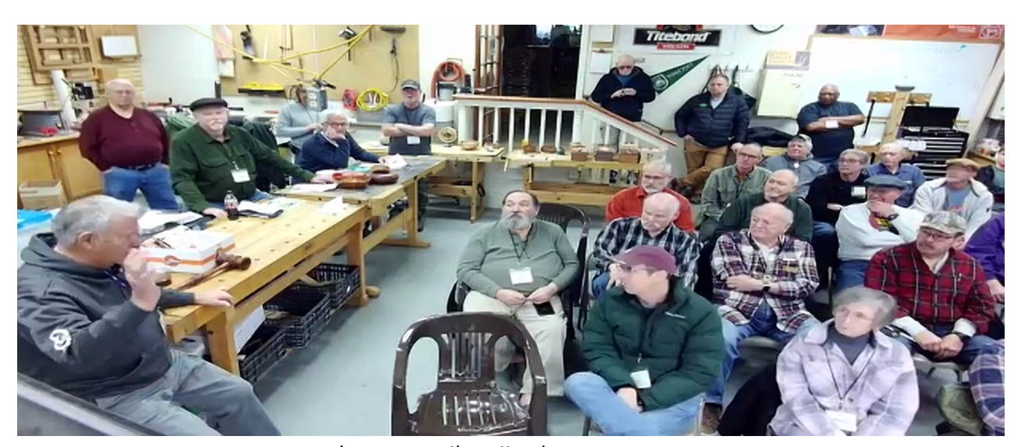
January meeting attendees

November 18 - General Meeting - TBD December 16 - Annual Christmas Party